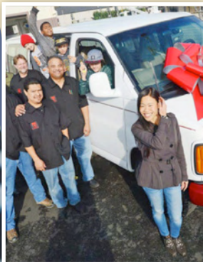
Staff members of Regal Collision Repair were on hand to deliver the renovated van to members of the SF Skate Club.