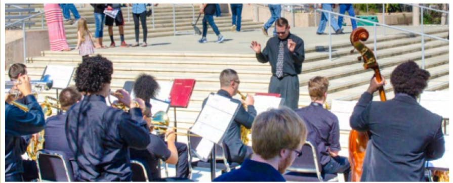
The LMC Jazz Band performed for attendees at the 40th anniversary celebration.

More information about the college's history and open house can be found at www.losmedanos.edu/openhouse .